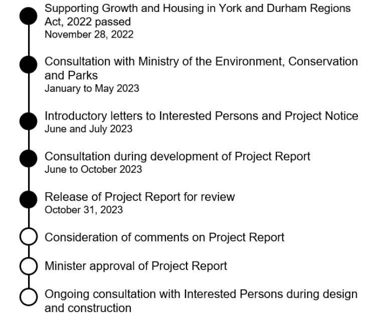
Figure 2.1 Consultation Milestones and Stages

Figure 2.1 illustrates the three Project stages and associated milestones, both completed (filled circles) and upcoming (unfilled circles).